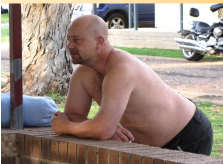
The common ' Bald Silver Back ' as only ever seen previously by Dr Jane Goodall in Southern Mongolia.

There was great excitement during the CMA NSW AGM at Mudgee in November when a visitor passing by the canteen area thought they had spotted a rare and almost extinct ( some scientists say they have been extinct for several hundred years ) creature know as the 'Bald Silverback Yowie'