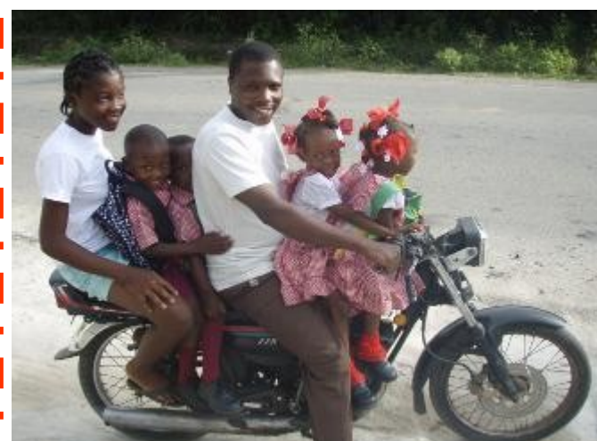
Wow only 6 on this bike. Looks like a human sandwich.