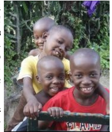
Some of the boys pre-