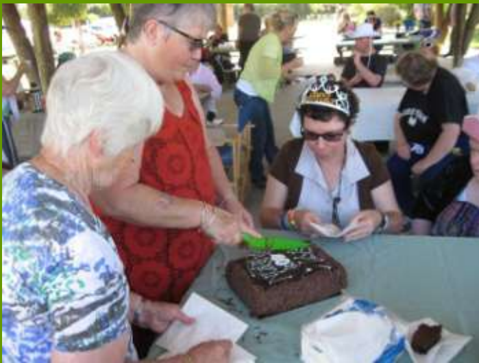
The Birthday Girl