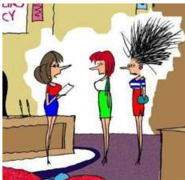
"I hear one of you rides a fast bike to work each day."