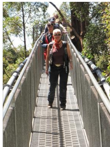
Riding & walking through the forests in south west WA.