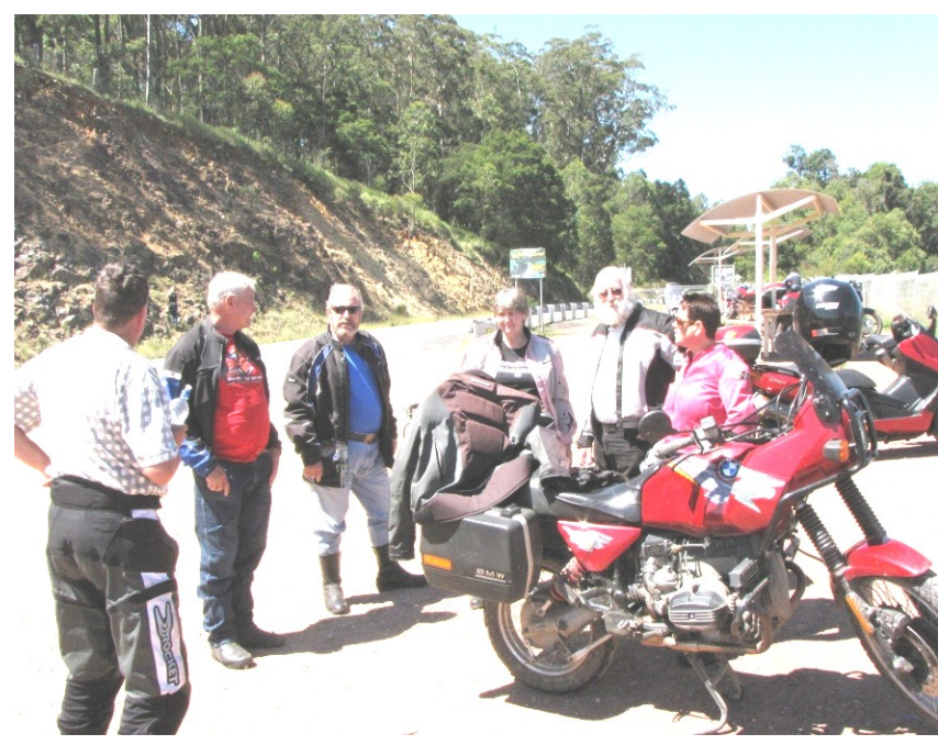
A short break along the Thunderbolts Way on the way to Nabiac