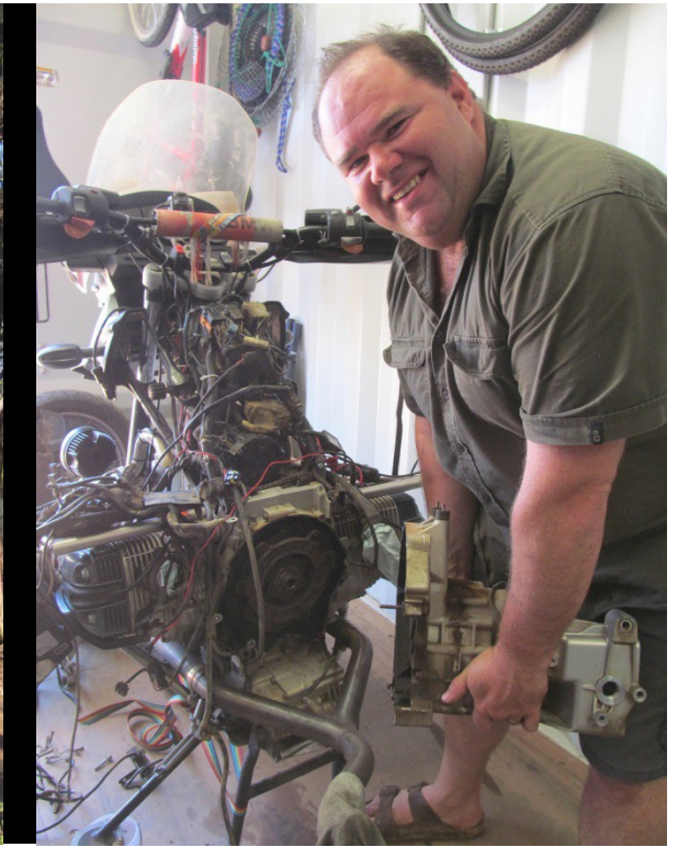
Back home stripping the bike.