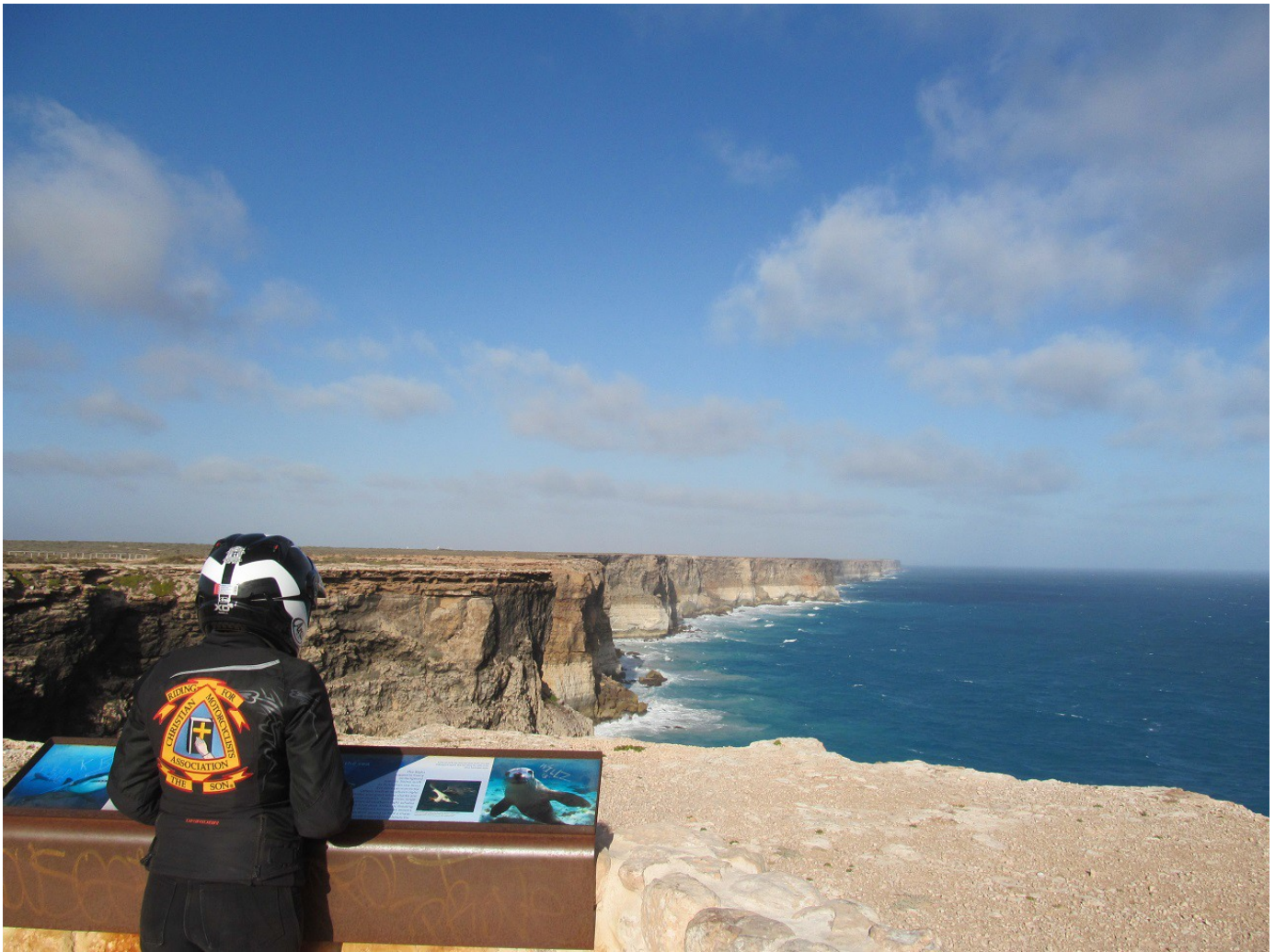
The cliffs at the Bight lookout.