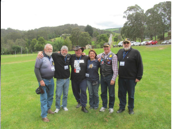
CMA WA members attending this year's Nat Run