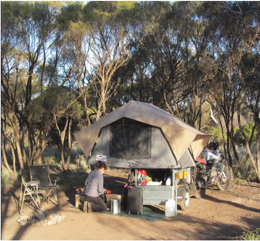
Nothing better than camping in the Australian bush.