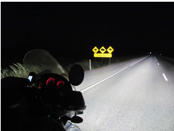
Nullarbor at night