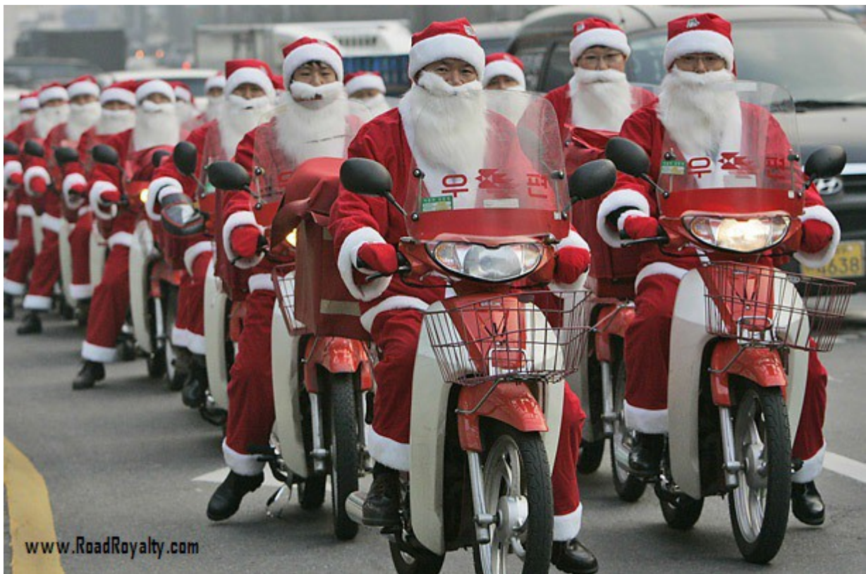
South Korean posties in the spirit of Christmas