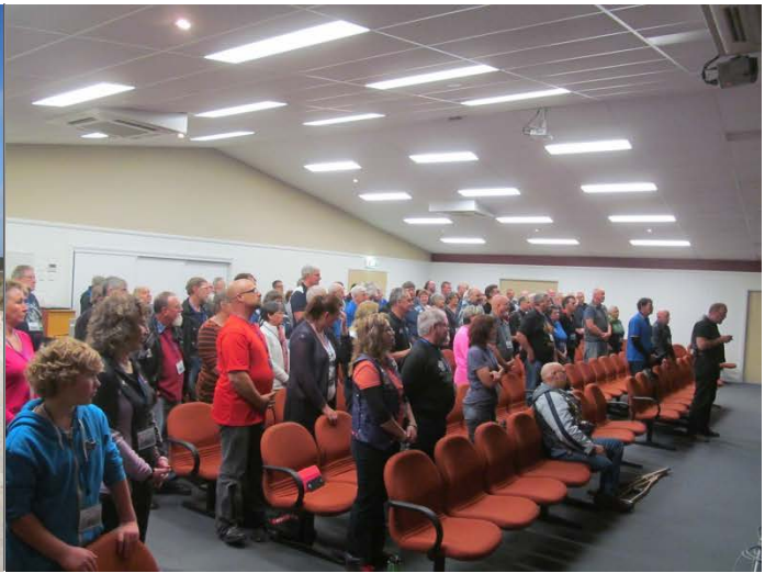
Praise and worship at the National Run