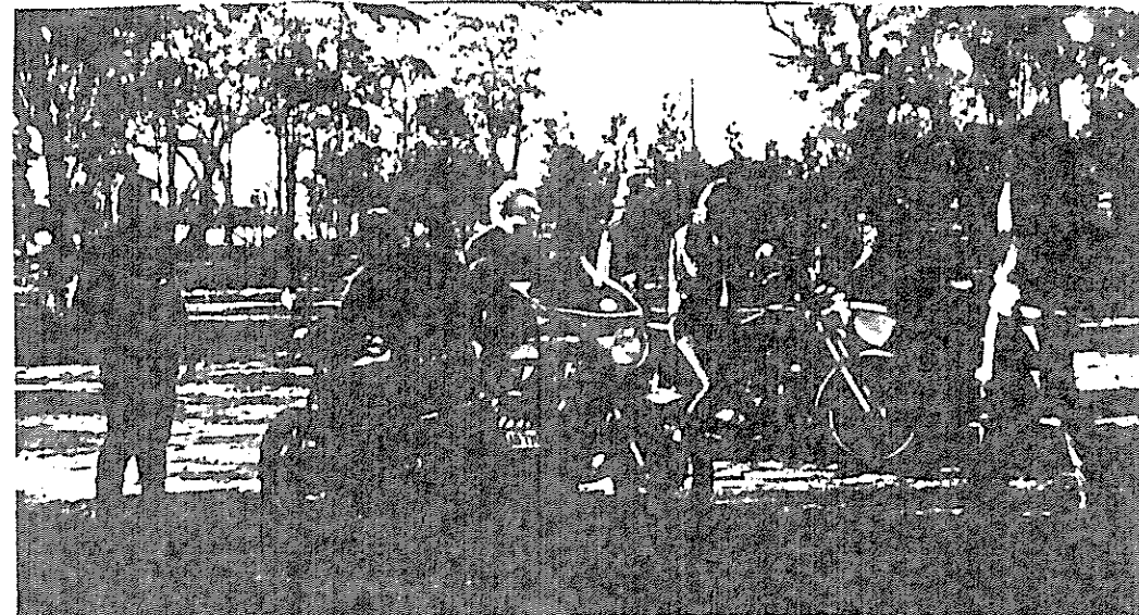
C.M.A. Club Teaching Weekend - March 1987

i) Membership of the Association expires twelve (12) months from the date of joining.